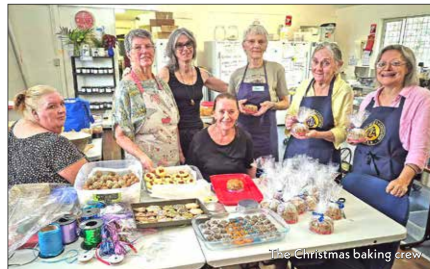
The Christmas baking crew