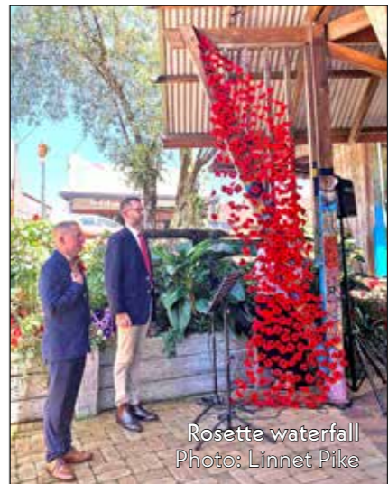
Rosette waterfall

Nimbin CWA are unable to take any more donations of goods until we re-open in January. We thank everyone who has supported us with quality donations of clothes and bric-a-brac to distribute to