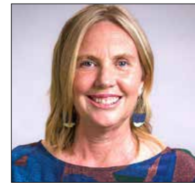
by Cr Virginia Waters Lismore City Council

graduation show at the Lismore Regional Gallery, which was absolutely marvellous; do check it out. The students' creativity and craftsmanship were a real celebration of future makers. It's incredible to see what can be created from earth with just water, air, fire... and imagination. As always, Aquarius Landcare remains a grounding space for me each month, joining with community, learning and reminding me why we must protect and regenerate what sustains us.