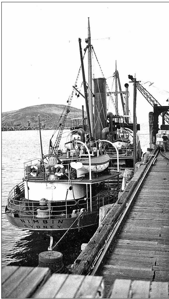
Loading bananas at Coffs Harbour – 1930's