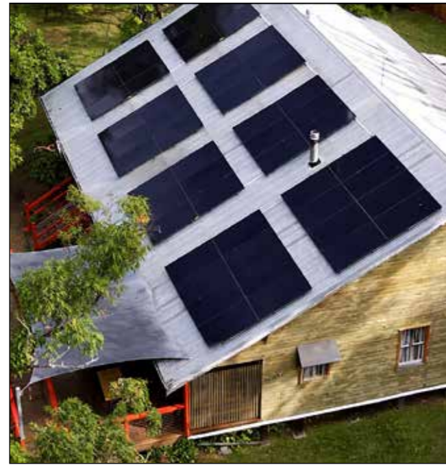
The store now boasts a solar upgrade by Rainbow Power Company.

"We really want to keep the spirit of the place," they say. "It's already something special."