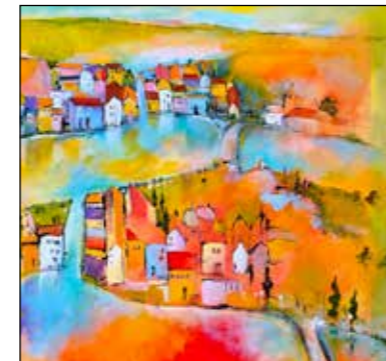
'Through Rose-coloured Glasses' by Warwick Wright

This intimate and uplifting evening invites you into a space of connection, reflection, and gentle