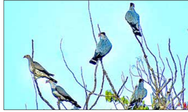
Topknot pigeons are a keystone rainforest species. Look for them through the winter in the canopies of tall trees.

Topknot pigeons inhabit rainforests with high tree species diversity. A large proportion of the tree species in these forests produce fleshy fruits that are consumed and dispersed by mammals and birds. One of the most