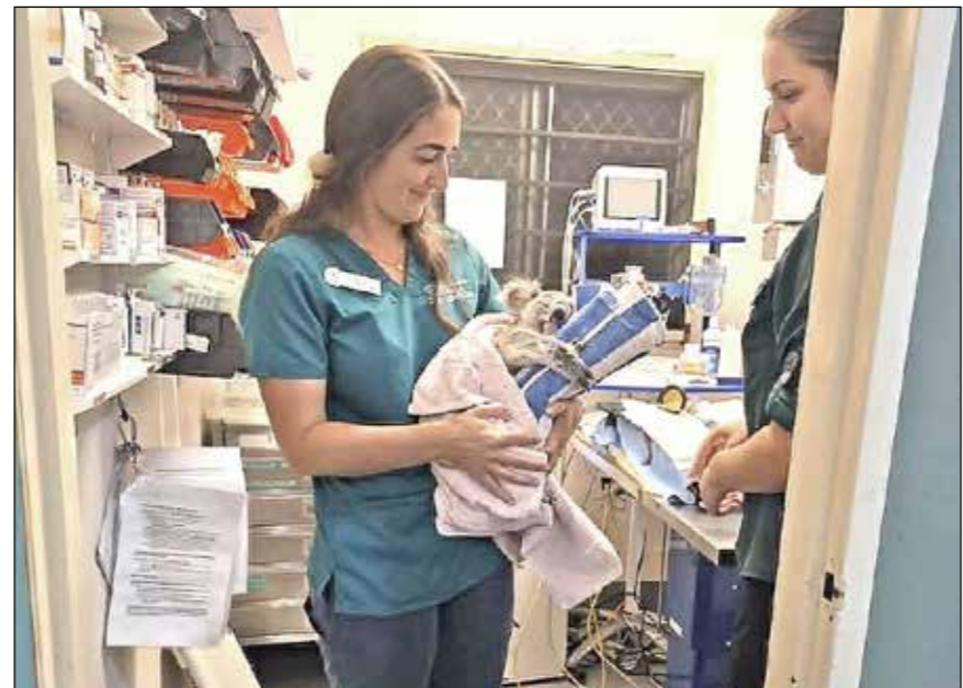
A veterinary nurse at the Friends of the Koala hospital in East Lismore

Grids on the road where the fenced area begins are also in place, however new grid designs are necessary as koalas learn how to navigate these old ones and can escape onto the road.