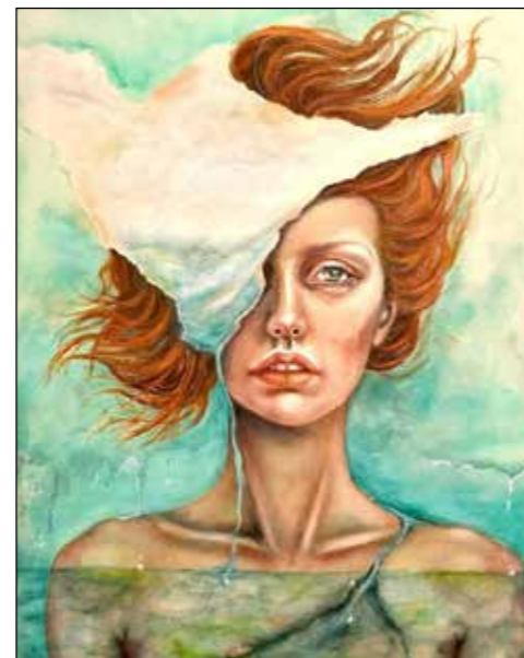
'Consciousness of Water' by Shannamay

Visit: https://blueknobgallery.com phone 6689-7449 or email: bkgallery@inet.net.au